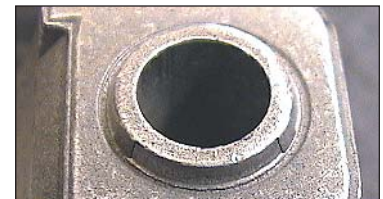
15° angle Z-Loc profile