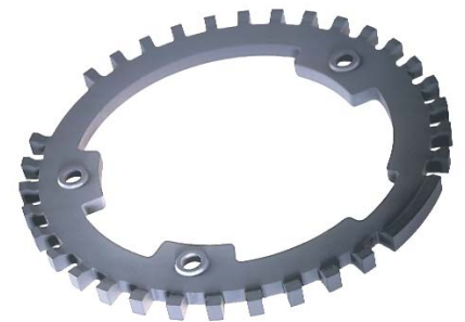
Sensor ring with Z-Loc