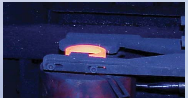
Race preform ready for forging