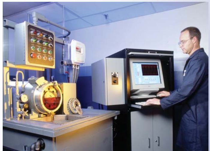
One-way clutch stroker test machine